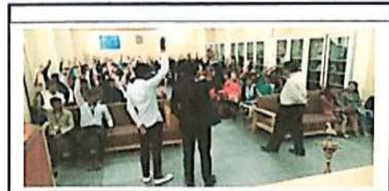
Student's participation in Activity